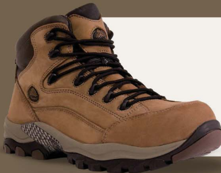
BICKZ 901 706 36466