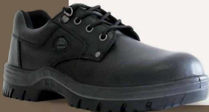
NEPTUNE 715 60511