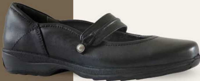
ANCHOR 524 61734

The Professional Collection is completely “Metal Free” so is a great choice for people in the security industry or frequent flyers who need to regularly pass through metal detection units, and don’t want the inconvenience of having to remove their shoes.