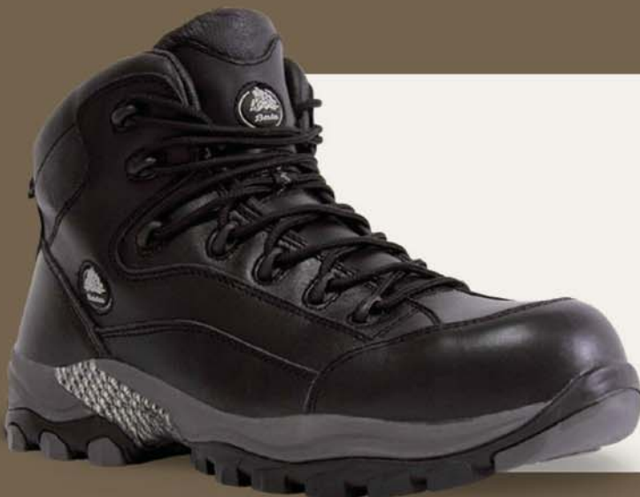
BICKZ 902 704 66467