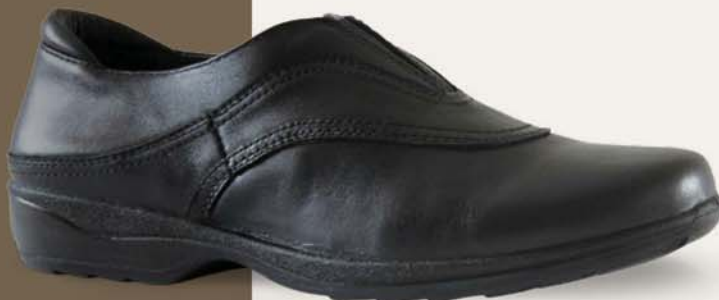
ENDURANCE 544 61735