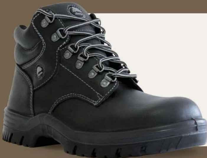
SATURN 705 60510

All the Bata naturals range come packed with features including the Tunnel System sole design. It features multi directional slip resistant sole pattern, channeling for improved liquid dispersal, heavier density PU outsole for durability, Lighter density PU midsole for cushioning, added grip at toe off, defined heel strike for ladder use, tunnel system for energy return, added grip at heel strike, oil & acid resistant sole and heat resistant to 130°C.